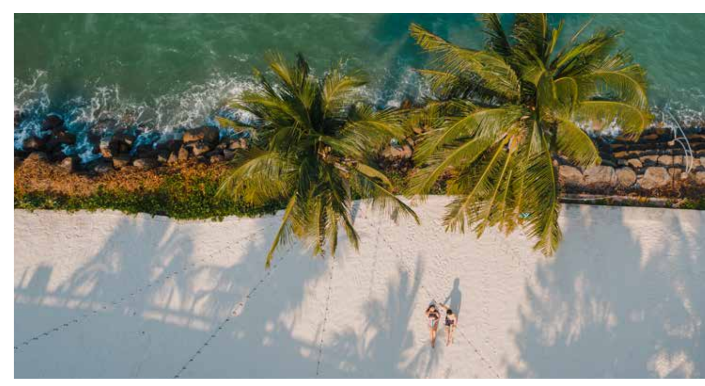
OPEN DAILY FROM 09.00 AM - 7.00 PM