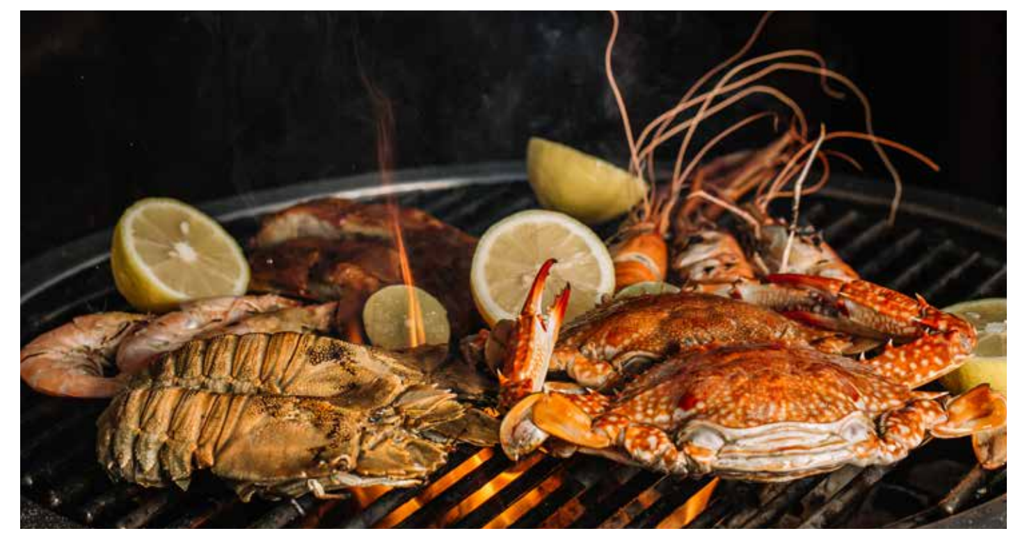
MARVELOUS BBQ SEAFOOD BUFFET

OPEN DAILY FROM 11.00 AM - 11.00 PM HAPPY HOUR FROM 7.00 PM - 8.00 PM